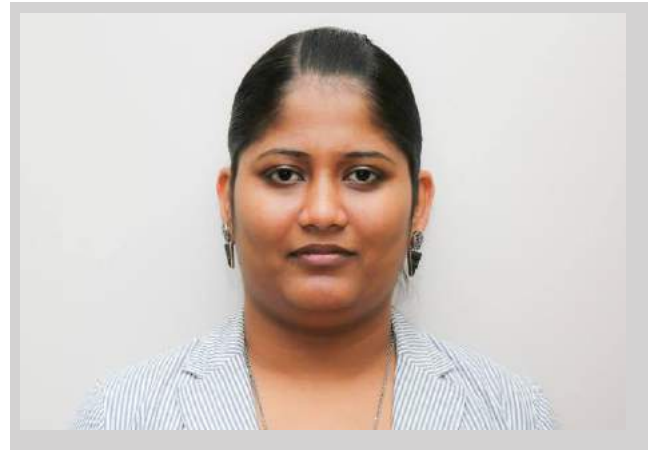
FINANCE & CONTRACTS DIRECTOR